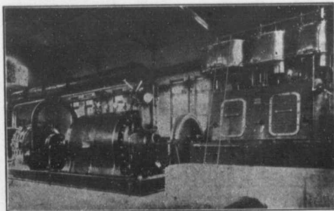
Stage Turbine Pump Electric Motor and High Speed Steam Engine. Built for the Montreal Water and Power Co., to do 4,500 Imperial gallons a minute against 300 feet head. Overall Eff. 70%.

for Water, Gas, Culvert and Sewer HAMILTON, ONT.