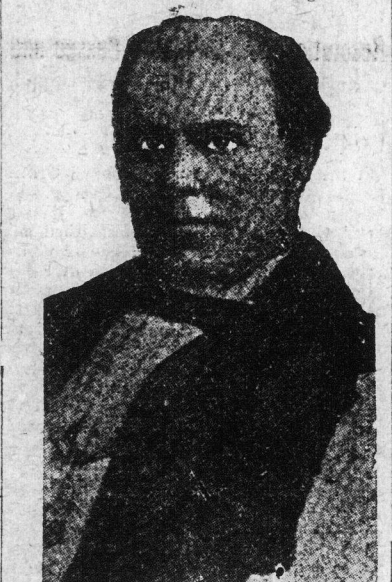
Very Rev. Randall T. Davidson Archbishop of Canterbury and Primate of All England, who crowned King George.

The crowds of people who waited patiently along the line of march of the military parade were not disappointed. The parade for the city has rarely seen such a fine turnout of local troops. With more than 1,000 in line and four bands, the militia units that marched from the barracks square were cheered repeatedly by the whole route of march. A large crowd