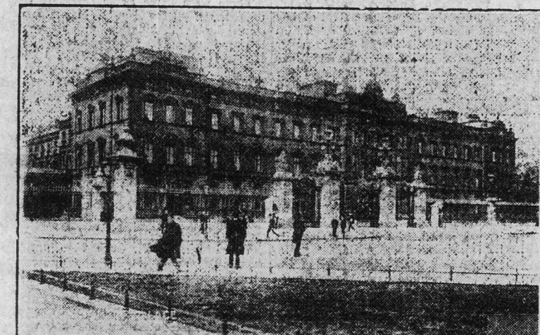
BUCKINGHAM PALACE, THE LONDON RESIDENCE OF THE KING.