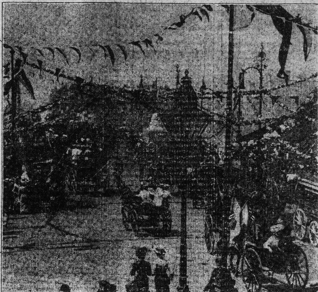
WESTMINSTER BRIDGE, LONDON, DECORATED FOR CORONATION DAY.