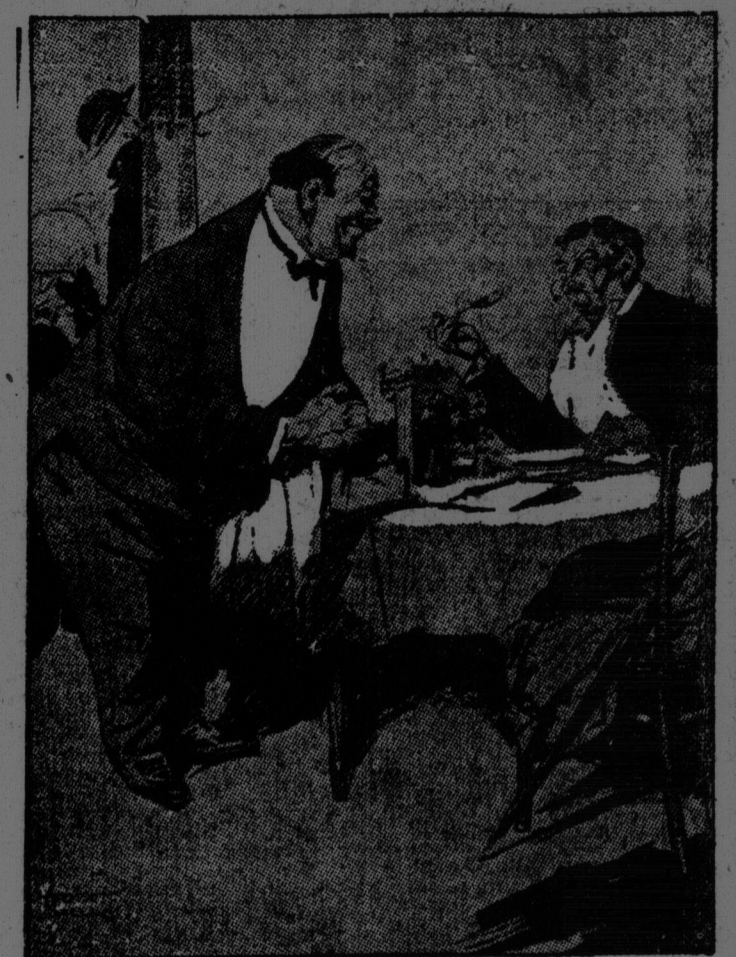
Diner—Look, waiter! There's a gray hair in this soup. Waiter—Ah, m'sieur is like me! M'sieur regret also se leste blonde cook is gone.