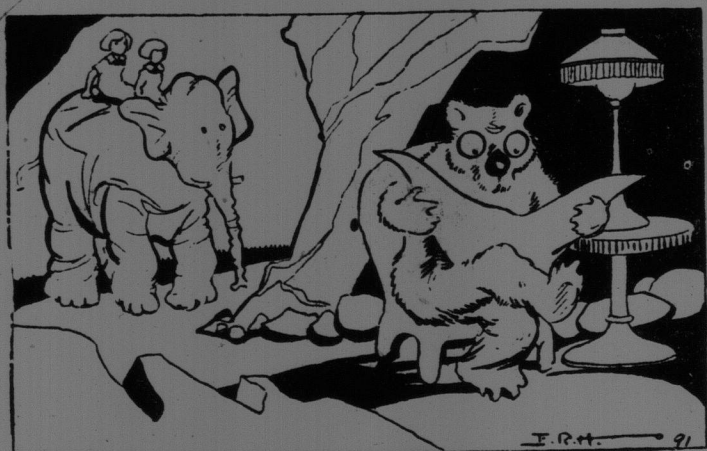
There sat Mister Bear reading his paper.

"Let's go to see Petty Polar Bear," said Weeny to the Twins. "All right!" said Nancy and Nick. "Up north near Santa Claus," said Weeny. "Near Mister and Mrs. Seal?" asked Nick. "Not so very far," said Weeny. "If I hadn't floated away on an iceberg, we'd have gone to see Petty while we were up north before. But since we have so much magic along, it won't take us long to go back. Got my satchel with my mighty and special?" "We've got it," said Nancy. "And your tooth-brush, too." "Then all aboard for Santa Claus Land!" cried Weeny, swinging his trunk back and forth, pretending he was a brakeman with a lantern. "Toot! Toot!" And away he started to the cold, cold north to visit Petty Polar Bear, his old circus friend. And you'd be surprised how quickly they got there on the elephant express. You'd certainly be surprised! Why, in no time at all they were