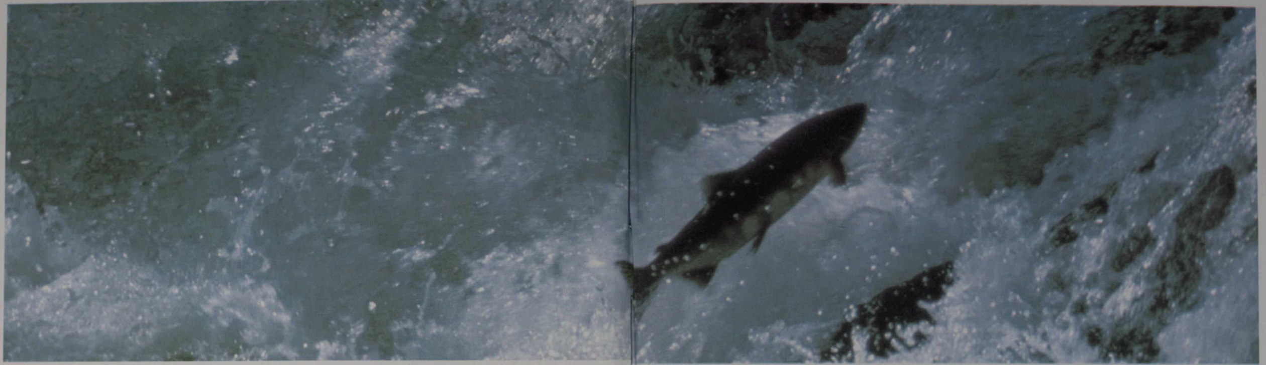
The powerful spawning urge sends this pink salmon leaping up a waterfall in Alaska.