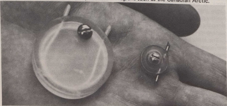
Small discs containing pancreatic tissue can be implanted in diabetics to eliminate the need for daily injections of insulin. These implants were developed by the Connaught Laboratories in Toronto with the assistance of the National Research Council.

More and more offshore drilling is being done for petroleum and natural gas reserves. The NRC and Canadian industry are together developing advanced glacial technology to make possible year-round exploration and development in the country's outlying regions such as the Canadian Arctic.