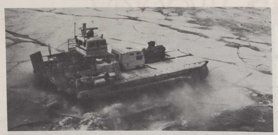
NRC scientists are studying air-cushion vehicles to determine why they can break ice more easily and economically than conventional icebreakers. Air-cushion vehicles were developed mainly for carrying cargo over rough terrain.

realizes its value and agrees to take over the final development and applications.