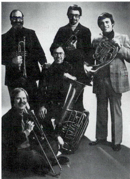
The Canadian Brass Quintet will be in the U.S. in March before leaving for a tour of China, March 10 to 24.

The Canadian Brass Quintet have made their name as "unstuffy" per-