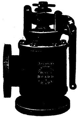
Board of Trade Pattern Drop Lever Pop Safety Valve.