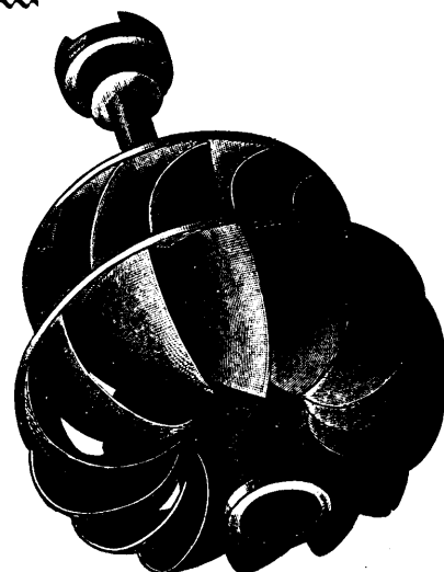
Cut Showing Wheel Removed from Case.

84 per cent. of power guaranteed in five pieces. Includes whole of case, either register or cylinder gate. Water put on full gate or shut completely off with half turn of hand wheel, and as easily governed as any engine.