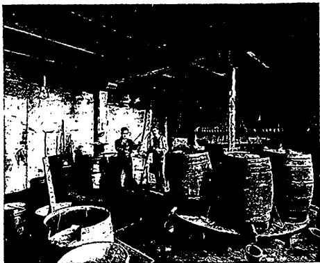
A CORNER OF THE PAINT-MIXING ROOM.

have spent weeks and months of labor will, upon application, be found unsuitable for the conditions under which the machine has to work.