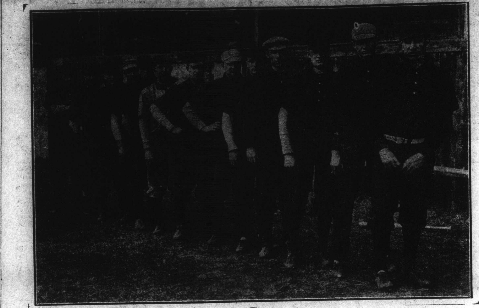
EDMONTON'S 1910 TEAM IN THE WESTERN CANADA LEAGUE