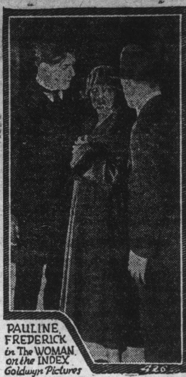
PAULINE FREDERICK in THE WOMAN ON THE INDEX Goldwyn Pictures