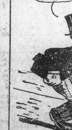
MINARD'S LINIMENT CURES DYPHTHERIA.

SHAKESPEARE RIGHT. HERE, BUT NOT SUR TOMORROW MUTT! IF HE'S