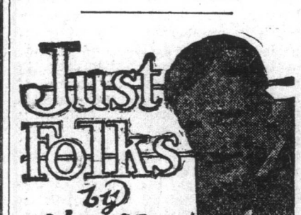
NO ROOM FOR HATE.

power, in the only sense in which it was ever understood by Junkertum, is obliterated. The treaty in its final form is the death certificate of German militarism and German imperialism, and as affecting the welfare of mankind, that is its most important provision.—New York World.