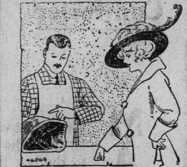
JUST AS YOU WANT