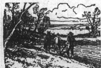
The American Farmer the Best in the World.

Regular weekly prayer meeting on Wednesday evening at 8 o'clock.