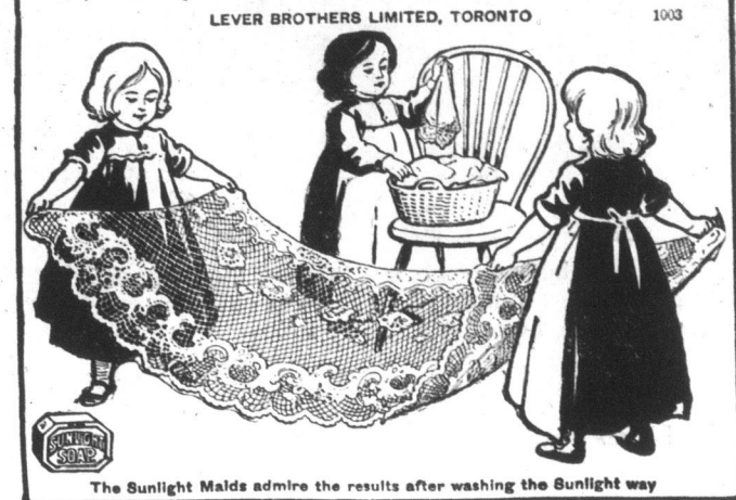
The Sunlight Molds admire the results after washing the Sunlight way

is guaranteed to be absolutely pure, containing no ingredient that will injure the daintiest fabric. It washes equally well in hard or soft water without boiling or hard rubbing. Follow the directions on the package and you will have a more successful wash with less labor. Your dealer is authorized to refund the purchase money to anyone finding cause for complaint.