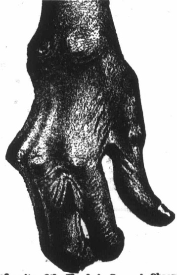
Deformity of the Hands in General, Chronic Articular Rheumatism.

Rheumatism, Lumbago, Sciatica, Pain in the Back have been cured, in the real meaning of the word, by a little Stillingia, Iodide of Potassium, Poke Root, Guaiac Resin and Sarsaparilla. Any person can take these remedies in any reasonable amount with perfect safety, and the results have been found to be astonishing. It has been proven that this combination makes up the best rheumatism remedy in existence, having actually cured many stubborn cases of over 30 and 40 years' standing—even in persons of old age.