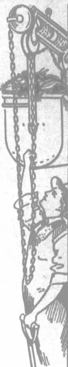
A Lad can work Loudon Feed and Litter Carrier with ease

A last word. You can save a hired man's wages by equipping your barn with Louden Equipments. Put that in your pipe and smoke it. Then ask us to prove it.