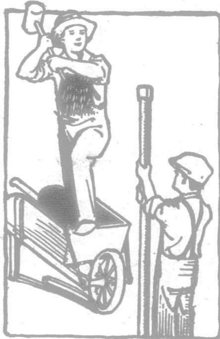
The boy and you can set as many tubes in a day as three men and a boy can set cedar posts.

Then, when we give you a fence that you can put up in shorter time and with less help, we save you money. In other words, we give you a lower price on your fence.