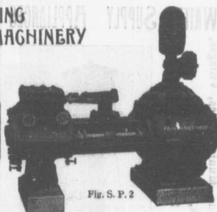
Fig. S. P. 2