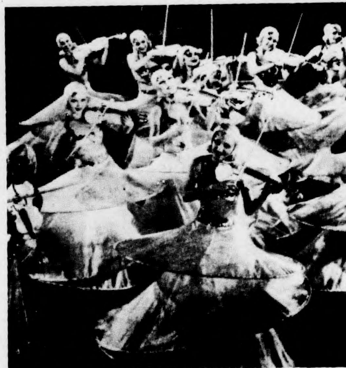
"Gold Diggers of 1933", a Hollywood musical and Depression period piece to boot, is being shown tonight at 8 p.m. as part of the Founders Winter Weekend program.

8 p.m. — Folk Dancing (Jewish Student Federation) Grad. Lounge, Ross.