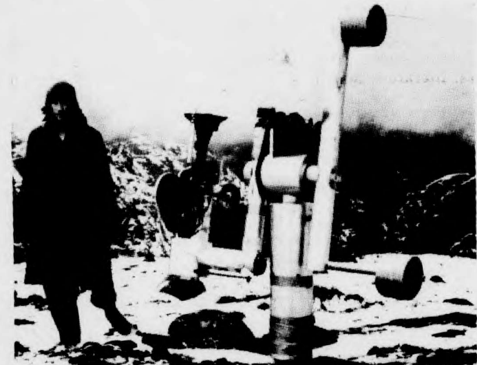
Michael Snow's epic film exploration of everything on earth within sight of a central point — "La Region Central" — will be shown today in Curtis I, from 2 p.m. - 5 p.m. Mr. Snow will be present to discuss this important experimental film.