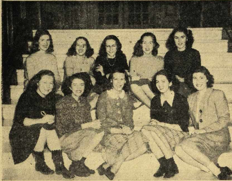
... EXECUTIVE OF DELTA GAMMA