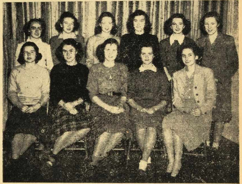
... EXECUTIVE OF D. G. A. C.