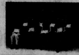
Women's Bball AUAA awards Sports, page 10