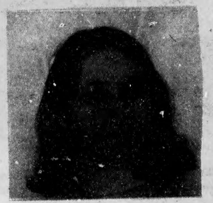
Arts 4 Nancy DeGrasse Engineering 1

A lot of people think it is a good idea because it is close enough to the campus and it is one way to get it cleaned up.