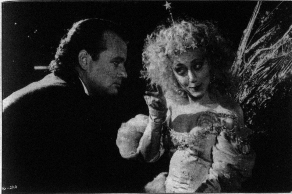
Bill Murray and Carol Kane: Scrooge was handing out the good lines in this one.