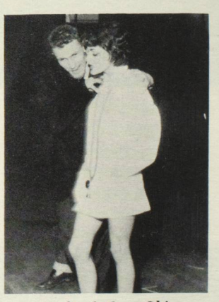
Medical Care Skit