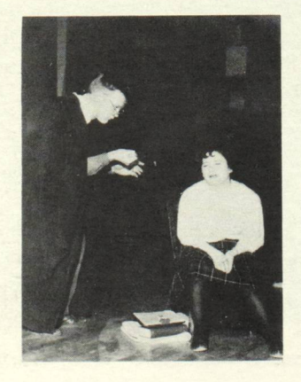
"The Lesson" by Eugene Ionesco