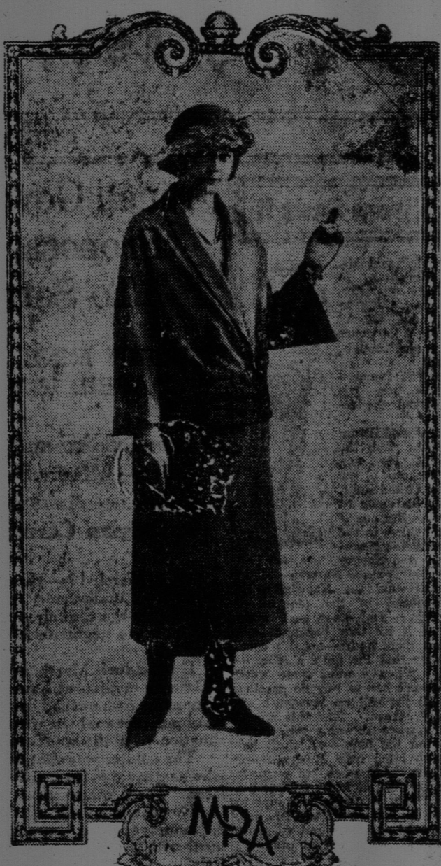
Costume of sand Polret Twill modeled in Egyptian pattern. A youthful and becoming model. To be shown at the M. R. A. Ltd. Fashion Exposition on Tuesday. (Actual Photo.)