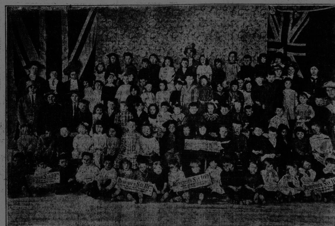
TAG DAY TOMORROW FOR THESE LITTLE ONES.