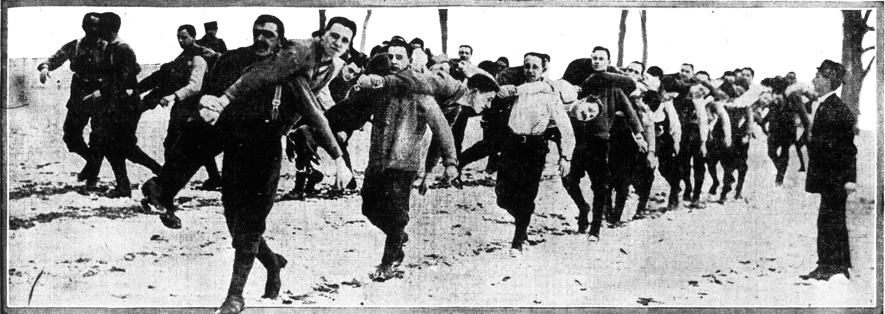
Members of the Queen Victoria Rifles, a London volunteer regiment drilling in the snow at Hyde Park, learning the proper way to carry a wounded comrade.