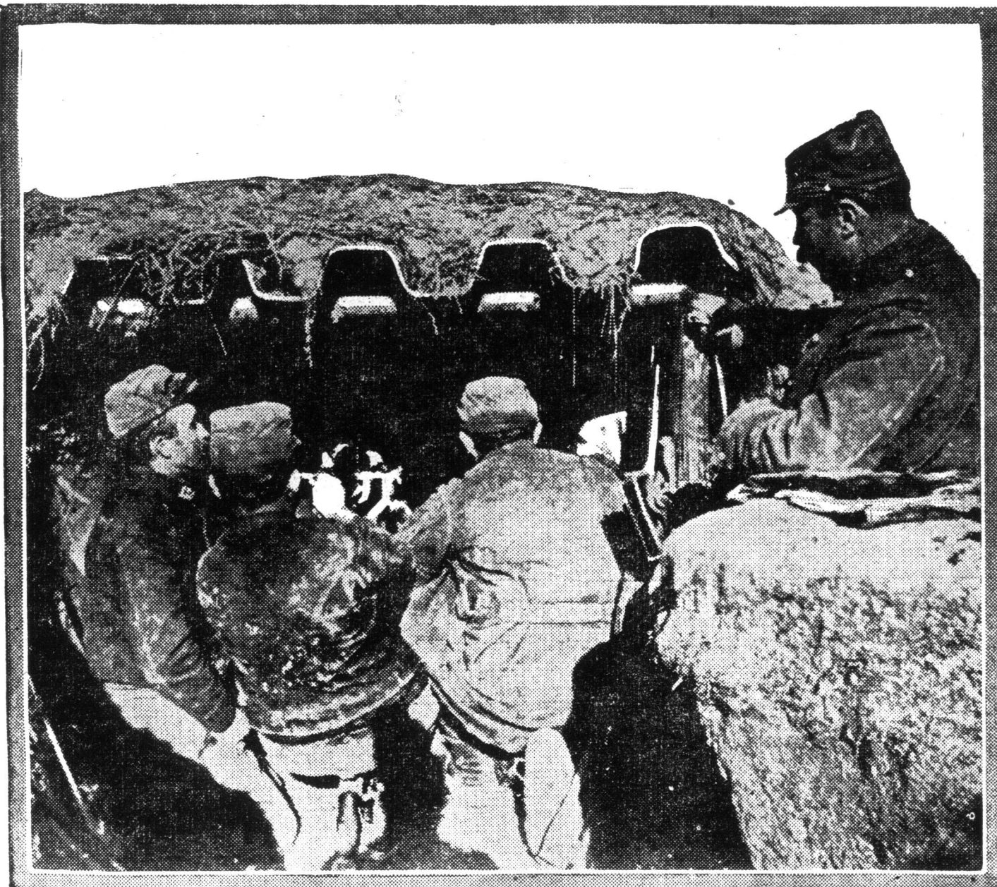
Using French mitrailleuse machine gun in a trench at Aubrieu.