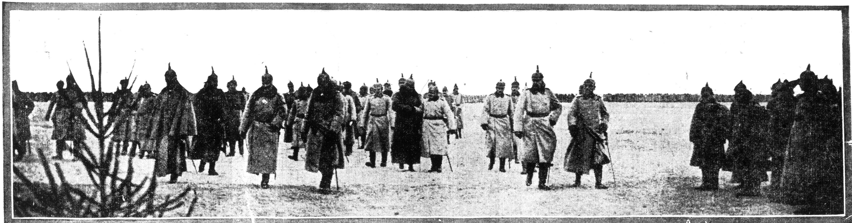
The Kaiser, the centre of the three foremost figures on the left, reviewing a few of the masses of troops he has hurled into the massacre in East Prussia.

approach, but later upon the graves of and most devilish eds" found upon a tittle to such a on a back window sguided and dis- ed old arms in a