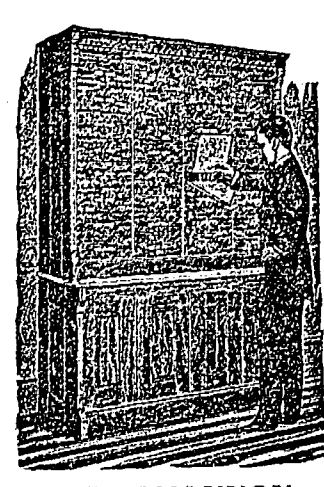
THE SHANNON Letter and Bill Filing CABINET.