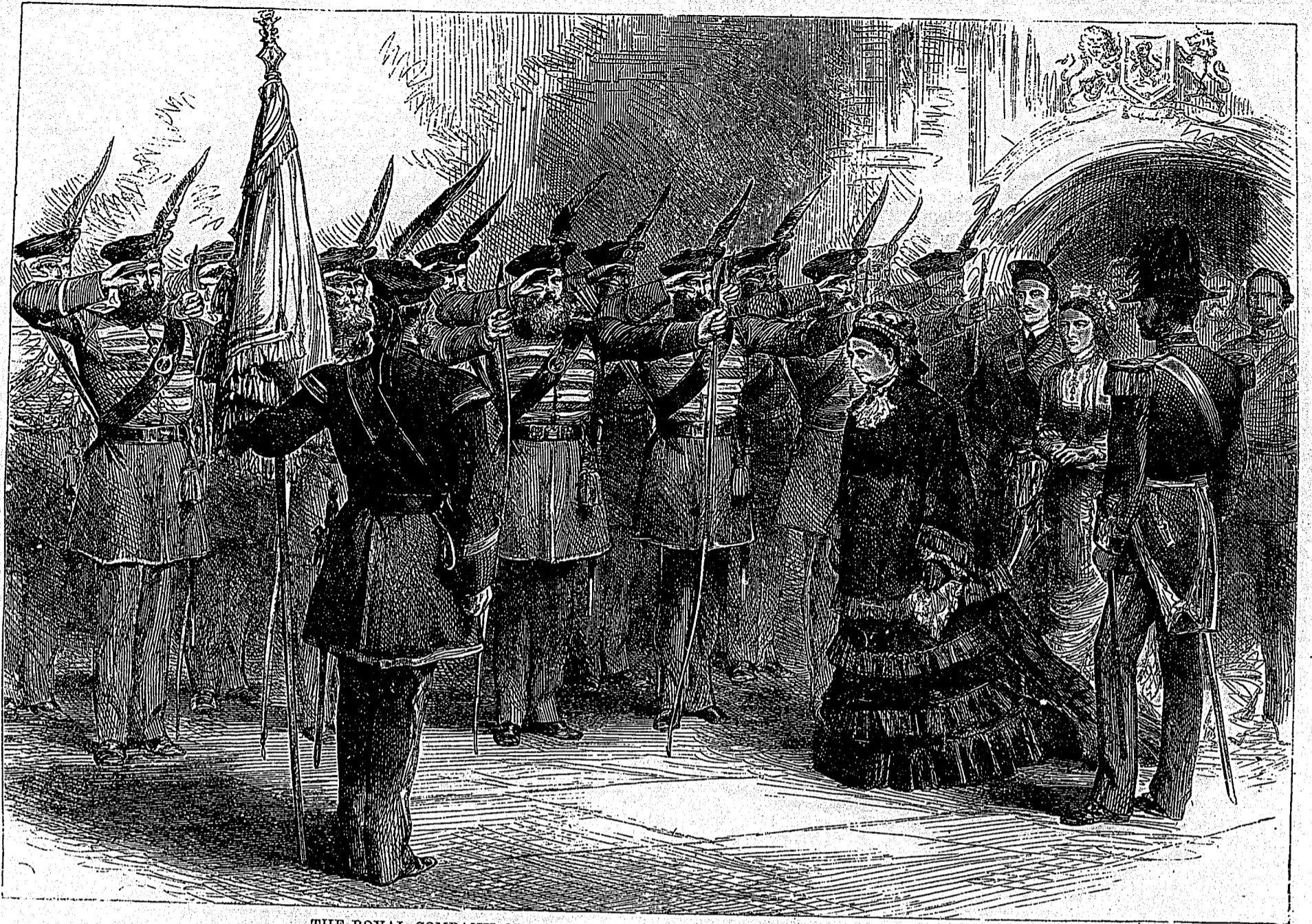
THE ROYAL COMPANY OF ARCHERS, THE QUEEN'S BODY GUARD IN SCOTLAND.