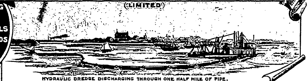
HYDRAULIC DREDGE DISCHARGING THROUGH ONE HALF MILE OF PIPE.