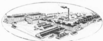
THE COCKSHUTT PLANT

With a touch of the foot, scrapers can be set to clean the harrow in heavy or sticky soils. Notice the shape of the discs—they are made to cut and turn all the soil. This is not only the best looking disc harrow but the best working disc harrow—examine it at any of our dealers.