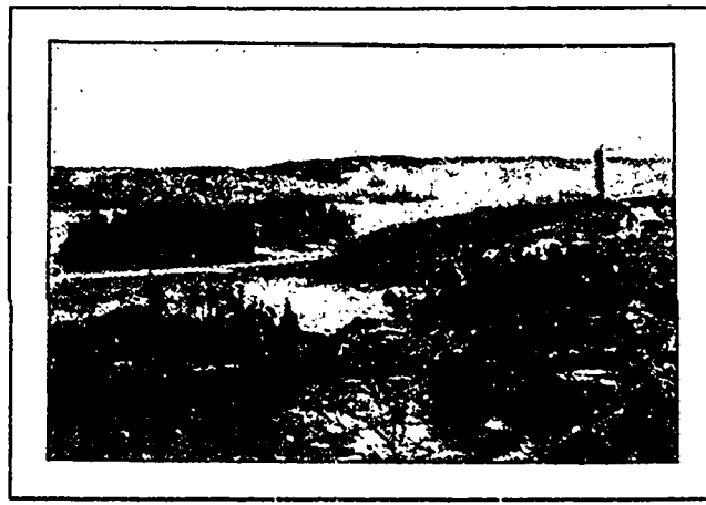
Above the Falls and Bridges, St. John.