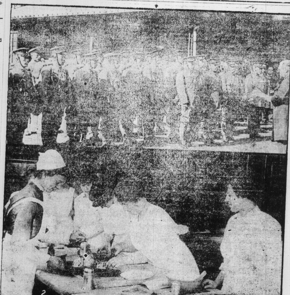
(1) Japan to Stop the Bolsheviks. (2) From Military School to Domestic Economy.—A Lesson in Bread and Confectionery.