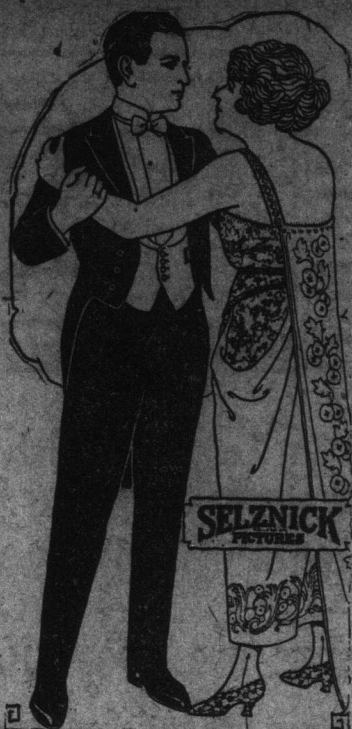
IT'S A SELZNICK SPECIAL

Phone 1009 for representative. may 9, 21