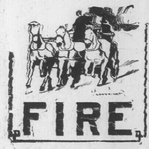
THE ALARM OF FIRE

is a dreadful thing for the man without insurance. Every time he sees the engines racing along his heart comes up in his throat if the