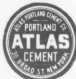
Largest Makers in the World.

for prices—Large stock constantly on hand.