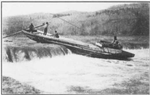
Running a partly loaded scow over the Grand Cascade of Athabaska River. The bed of the river is limestone, and the fall is about six feet. In high water full loads are run over the Cascade.

Journal of the Royal Astronomical Society of Canada, 1915