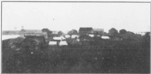
FORT MCPHERSON (Lat. 67^{\circ} 27' N. ). Taken on July 12 at midnight. About one-third of the sun is above the horizon ( 1 \frac{5}{8} inches from left side of picture). Exposure 2 minutes.