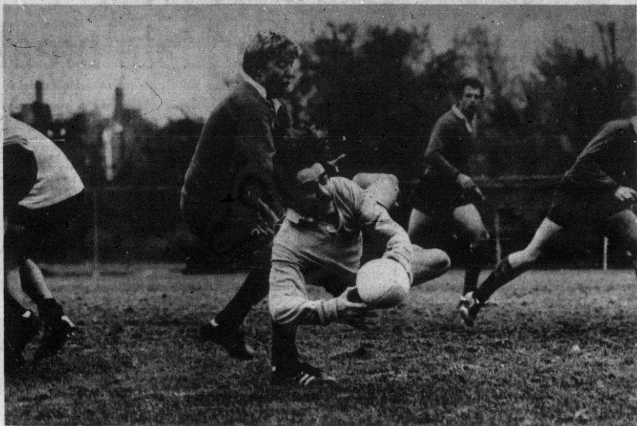
London St. George player vainly attempts tackle as Mississauga Crusader makes flying lateral. Home side won sweet revenge with