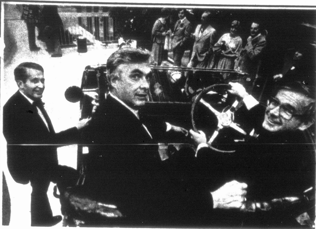
GORM LARSEN/THE TIMES