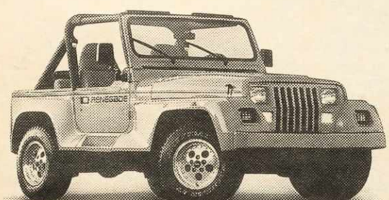
Jeep YJ The fun-to-drive convertible From $11,825***