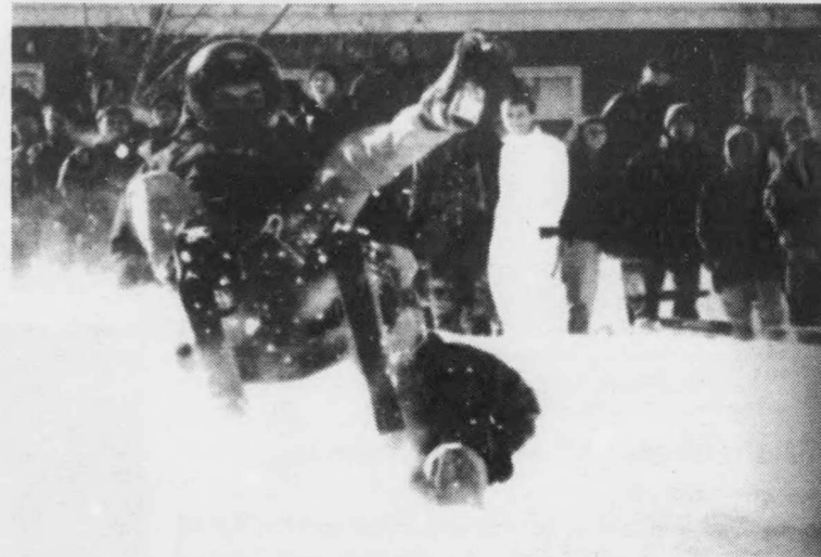
Don't meditate, just elevate

The rules are simple. Your racing contraption must consist of sitting device (e.g. toilet bowl, lay-z-boy, high chair, etc.) attached to a sliding device (e.g. skis, snowboards, etc.). You must also wear a helmet of some sort to contain any brain spillage that may result from a high speed crash. You may race as a team or on an individual basis. Time trials will be held and then head to head single elimination race will decide the winning positions. Waiver and release forms are available in the lobby of Head Hall and at the event on race day.