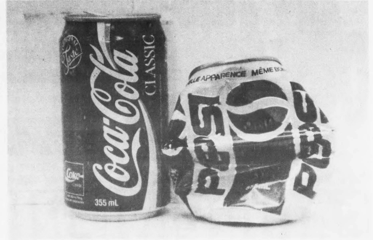
UNB has signed a five-year exclusivity contract with Coca-Cola Ltd.

photocopying, and the poster run. The Student Union Council also announced the distribution of a SUB Expansion Survey in selected classes next week. The survey was approved by the task force set up earlier this year to examine the issue of SUB expansion.