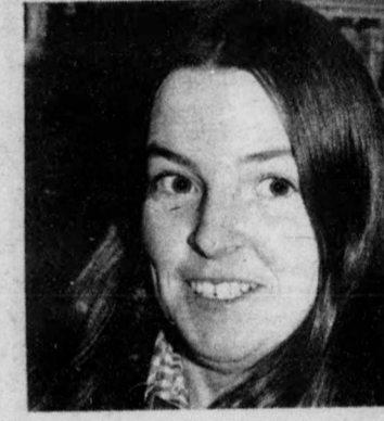
Wanda Tompkins Arts 1 A bottle of Ye olde Hudson's Bay Rum.