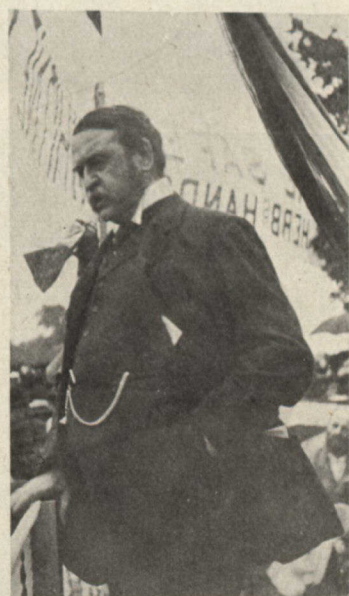
Sir James P. Whitney The Premier