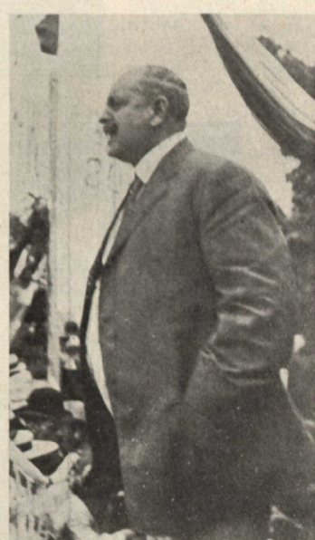
Hon. Dr. Pyne Minister of Education