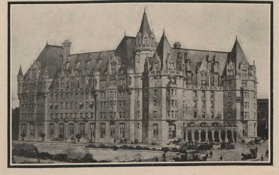
The proposed "Chateau Laurier."