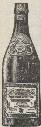
FAC-SIMILE OF WHITE LABEL ALE