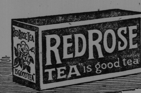
Red Rose Coffee is as generously good as Red Rose Tea

The Red Rose combination of Quality and Economy is obtainable only in the Red Rose package.