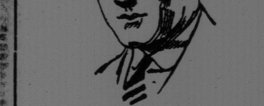
LAST WEEK OF

B.B.B. is manufactured only by The T. Milburn Co., Limited, Toronto, Ont.